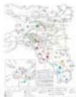
Map of ATTICA