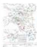
Map of ATTICA